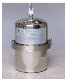
MP750SB or MP1200EL