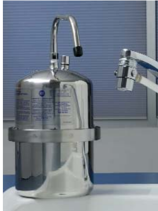
MP750SC Countertop Unit