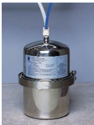
MP750SB Below Sink Unit