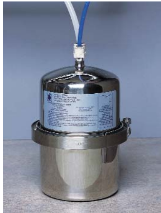
MP750SB Below Sink Unit